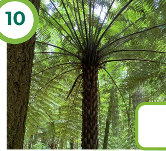
Silver Tree Fern